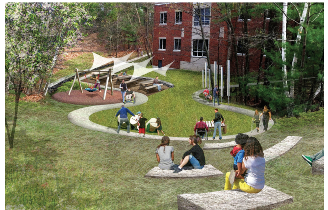
Proposed Outdoor Oasis